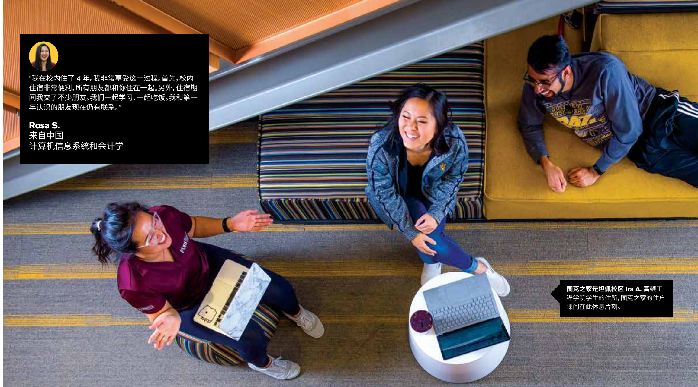
图克之家是坦佩校区 Ira A. 富顿工程学院学生的住所, 图克之家的住户课间在此休息片刻。